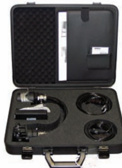
(446 301 023 0) Trailer Diagnostic Case