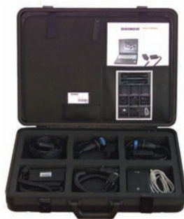
(446 301 020 0) Full Diagnostic Case