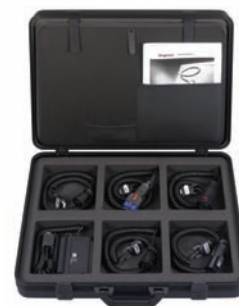
(446 301 025 0) Truck Diagnostic Case

WABCO System Diagnostics (SD) is a software program available for every WABCO-produced component requiring diagnosis. The program consists of a range of Windows-based software solutions, plus all the required hardware needed to carry out diagnostic work on WABCO systems, such as, Electronic Braking System (EBS), Electronically Controlled Air Suspension (ECAS) and Anti-Lock Braking System (ABS).