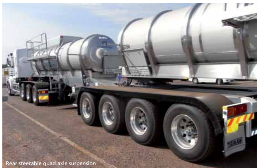
Rear steerable quad axle suspension

quad road train will deliver acid in the Northern Territory. "The road network is not particularly demanding as it is all undulating bitumen, but it's a popular tourist route. There's quite a lot of traffic on this route, and safety and stability were paramount when designing this combination," Bob explains. "Chemtrans offers nationwide transportation of dangerous goods of the full spectrum of dangerous liquids, chemicals, explosives and other products. We are flexible enough to meet the handling requirements of the most specialised materials; that's why safety lies at the heart of everything we do, from risk assessments to the equipment we use in the field."